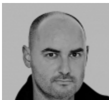
design Eugeni Quitllet

The collection of chairs and side table designed by Eugeni Quitllet reinterprets the hand-crafted tradition.